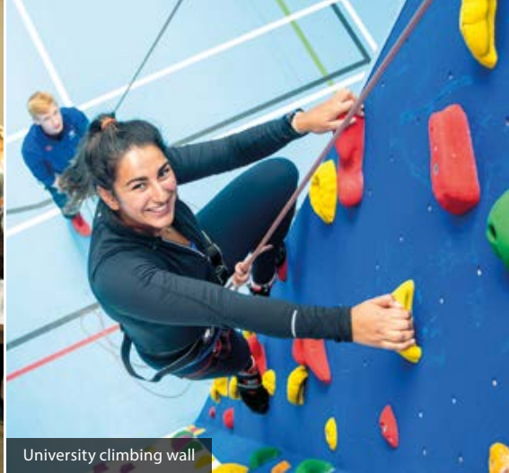
University climbing wall