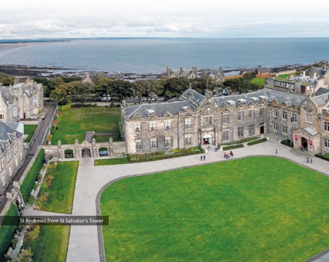
St Andrews from St Salvador's Tower

just two square miles – and the University's buildings are spread throughout the oldest and newest parts of town, making the town and University interconnected and highly cosmopolitan.