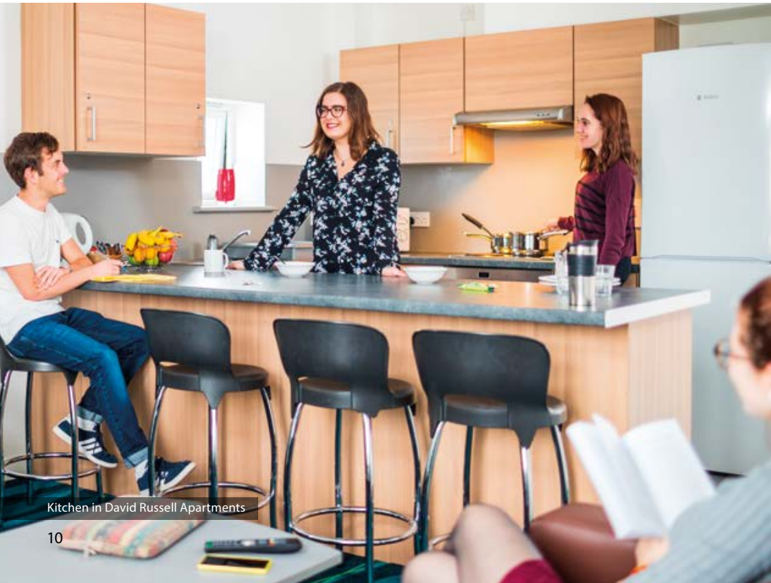
Kitchen in David Russell Apartments

See more information about DRA at: www.st-andrews.ac.uk/study/accommodation/halls/foundation