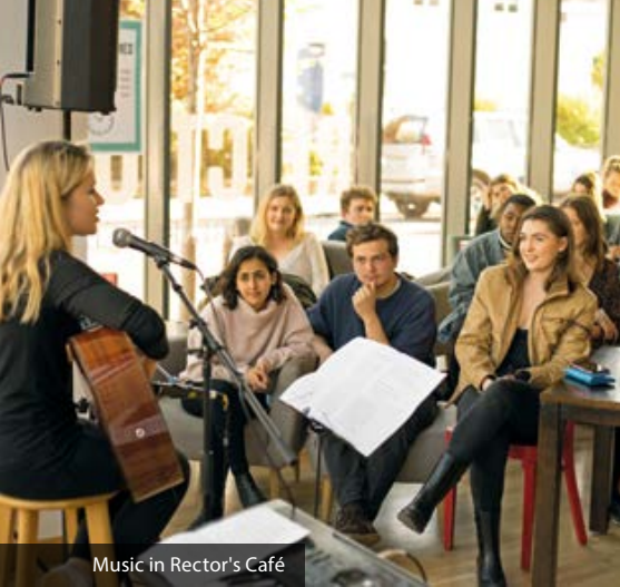
Music in Rector's Café