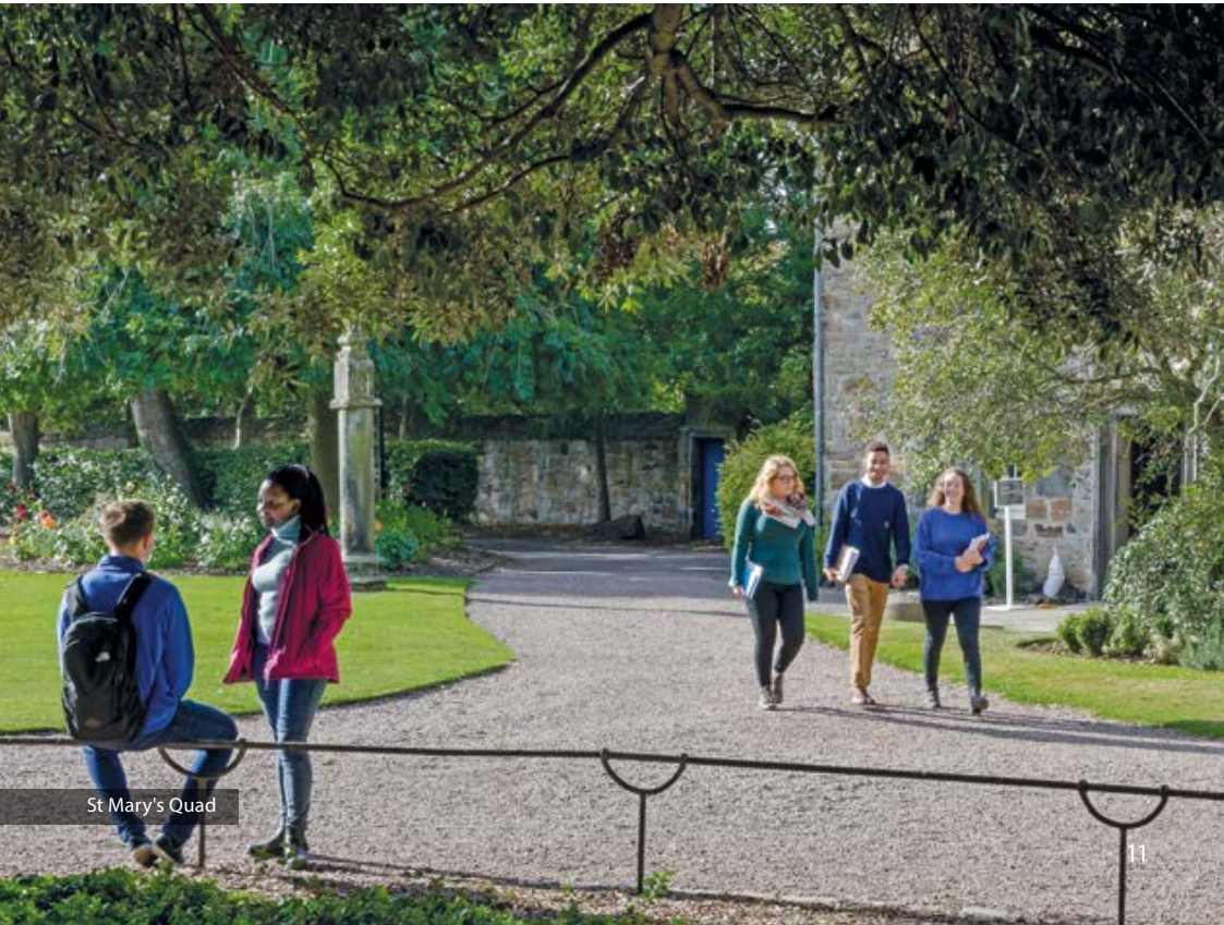
St Mary's Quad

Apply online at: www.st-andrews.ac.uk/subjects/study-options/foundation/apply